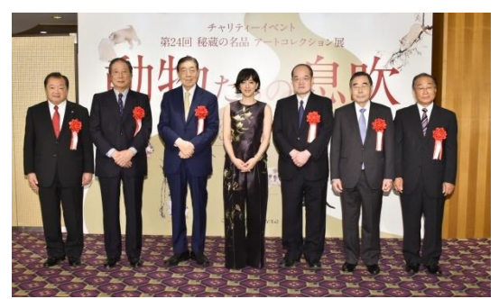
At the opening ceremony

Total donations: JPY 178,955,347 Total works displayed: 1,908 items