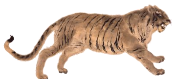
Kishi Chikudo (Tigers, Folding Screen) (part) Chiso Collection

For this year, in tribute to the name "Toranomom" (tiger's gate) in Minato City where Hotel Okura Tokyo is located, pictures with tigers and other animals will be on display. The exhibition titled "Lively Animals" will showcase 70 works of art, lent out with the support and cooperation from 35 owners including corporations, art galleries, organizations and individuals.