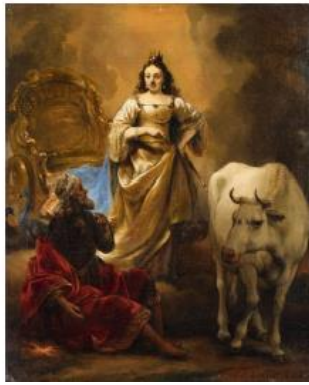
Gerbrand van den Eeckhout “Juno, Jupiter and Io” private collection