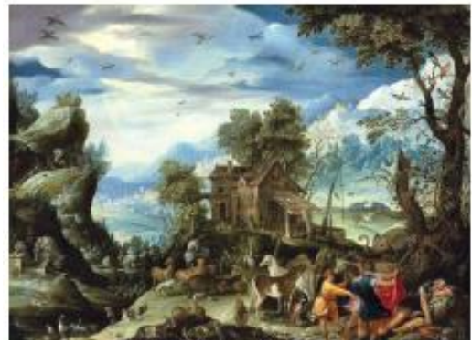
Attributed to the Circle of David Teniers the Elder “The Drunkenness of Noah” private collection