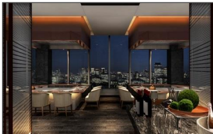
KANKO KIKAKU SEKKEISHA

Dining choices in The Okura Heritage Wing will include Yamazato, where guests will enjoy Japanese cuisine ranging from breakfast to kaiseki multicourse meals with views across a lovely Japanese garden, the Chosho-an tea ceremony room, and Fine Dining, which will serve culinary creations based on French cuisine accented with Japanese seasonal delicacies.