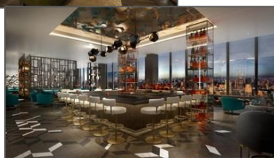
G.A. DESIGN INTERNATIONAL LIMITED

The Okura Prestige Tower's fifth-floor Orchid Bar will be a sophisticated, contemporary reinterpretation of the original Orchid Bar's tradition and prestige. On the top floor, Starlight guests will enjoy magnificent views of the Tokyo nightscape from three vantage points—The Bar, The Lounge, and The Chef's Kitchen.