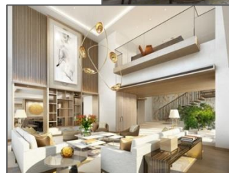
G.A. DESIGN INTERNATIONAL LIMITED

The spacious guest rooms in The Okura Heritage Wing will offer a generous floor area of 60m 2 with broad 8m widths. All rooms will feature the distinctive flavor of Japanese interior design and come equipped with mist saunas, spa bath for enhanced relaxation. The Okura Prestige Tower will offer standard-size guest rooms measuring some 50m 2 and afford vistas of the Tokyo metropolis from expansive windows.