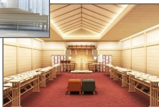
KANKO KIKAKU SEKKEISHA

The Okura Prestige Tower's wedding facilities will include the top-floor Sky Chapel for stunning views of Tokyo, the classically elegant Grand Chapel, and a hall for traditional Japanese Shinto weddings.