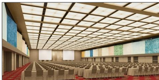
TAISEI DESIGN Planners Architects & Engineers

The Okura Prestige Tower will boast no fewer than 20 function rooms spanning a wide range of capacities. The Heian Room will accommodate up to 2,500 persons, making this one of Tokyo's largest ballrooms. Motifs from the Collection of Ancient and Modern Japanese Poems, a national treasure, will decorate the walls. The room will also boast a first-class audio and visual system.